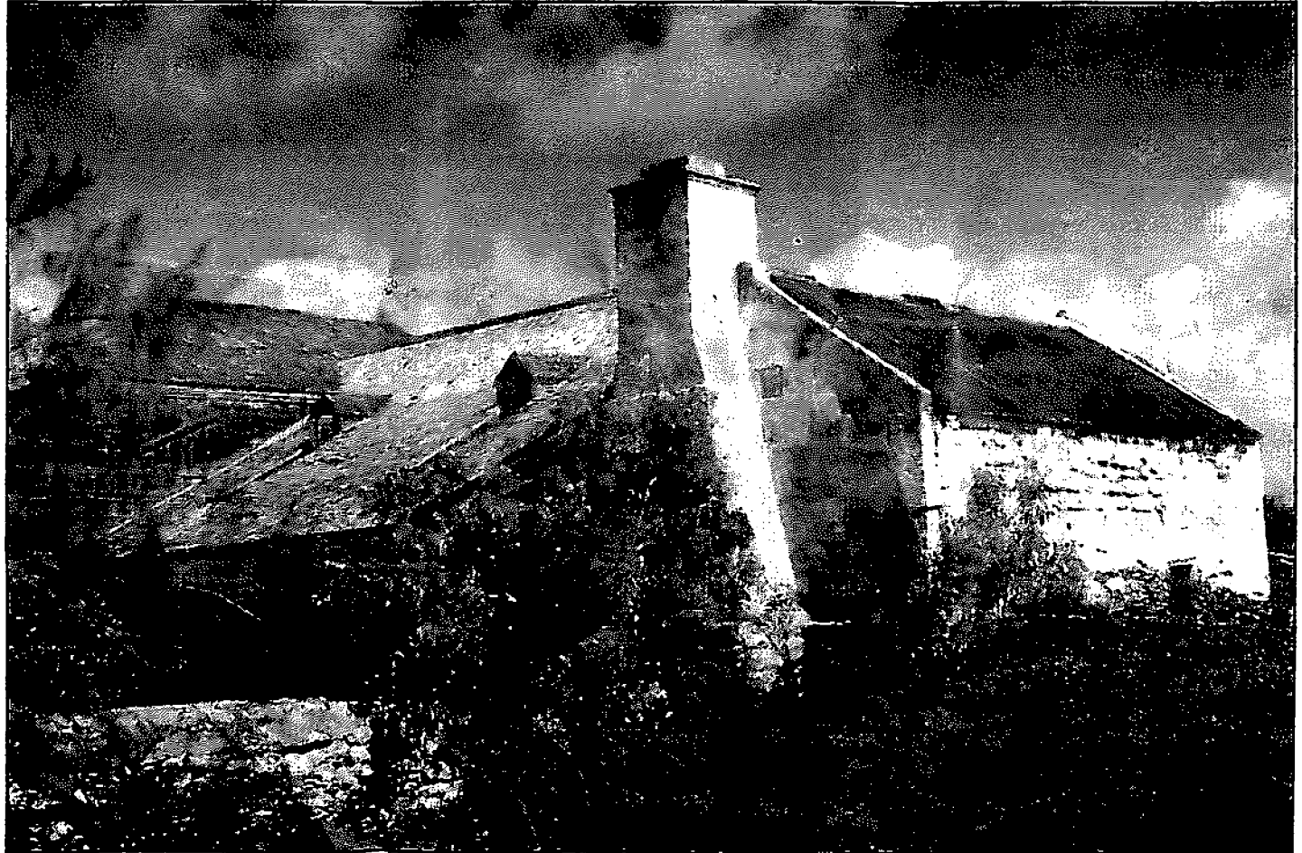
OVERGROWN: The old Government House's stone, brick and wood are weather beaten and decayed, but not unsalvageable.

Both of the old homes were built by and belonged to the Herriot family who